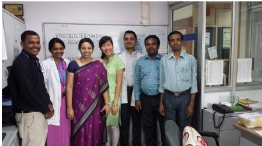
At Lions International Eye Bank of Bangalore