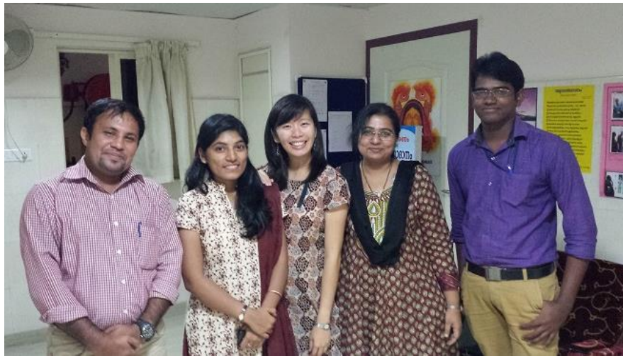
At Eye Bank Association of Kerala