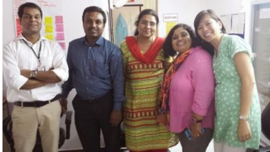
At Dr. Shroff's Charity Eye Hospital