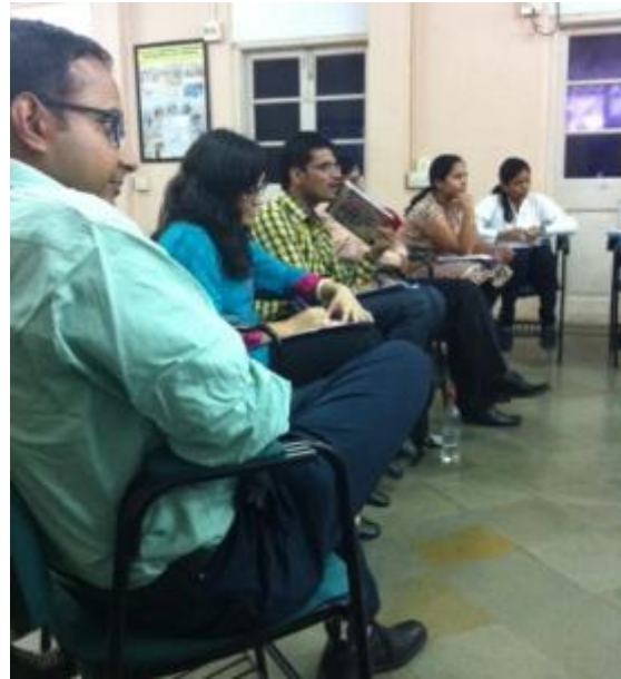
At Eye Bank Coordination and Research Centre

1. Activity 6: 6th CME Scientific Program held at Hyderabad from 26th September 2014 to 28th September 2014 and SightLife India Participated and delivered sessions amongst the world of Ophthalmology.