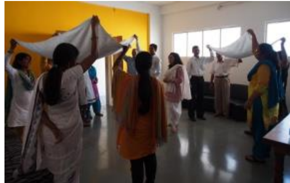
At H V Desai Eye Hospital, Pune