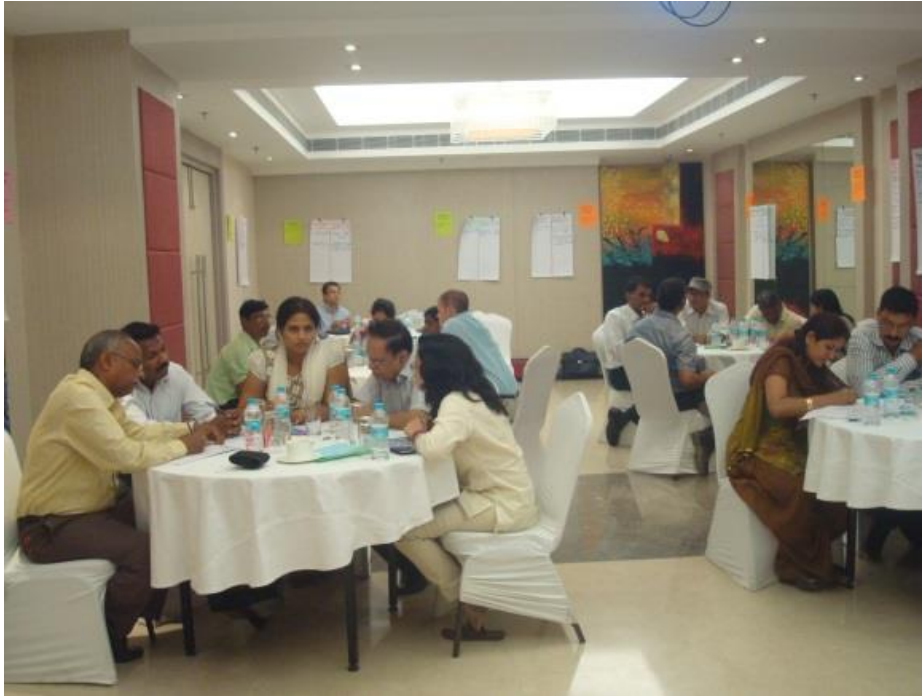
Picture shows participants in a working session during the JMR.

Future Actions: Continue organizing similar training retreats for Eye Bank Managers and Asst. Managers annually.