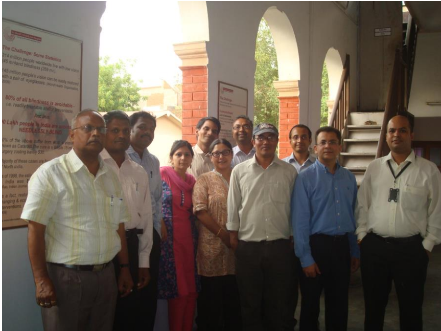
First Eye Bank Managers Retreat was held on June 4, 2012 at Dr. Shroff Charitable Eye Hospital, Daryaganj, New Delhi. 7 managers from all over India attended the workshop (see list above).