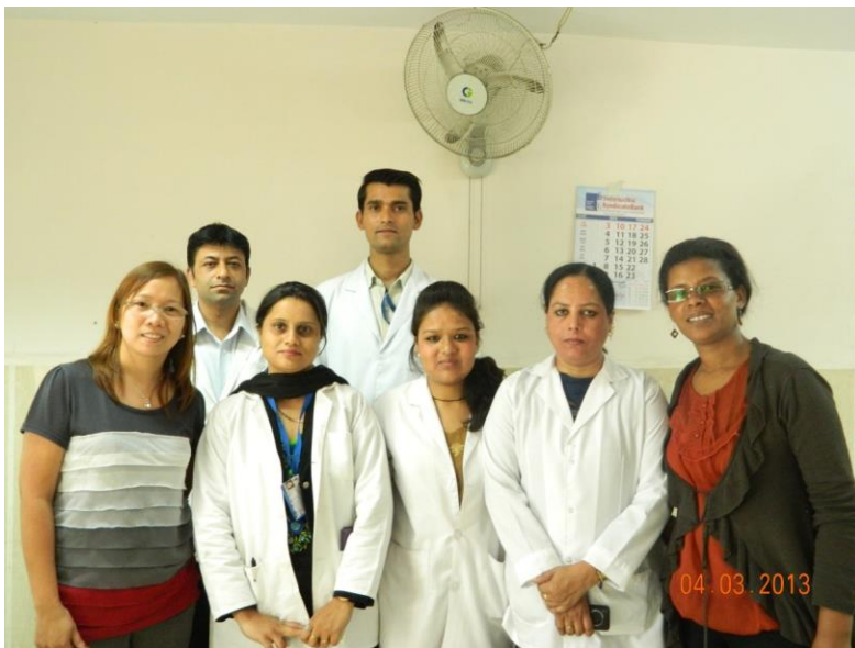
New Managers with Eye Donation Counselors at LNJP Hospital, Delhi during March 4-5, 2013 Workshop